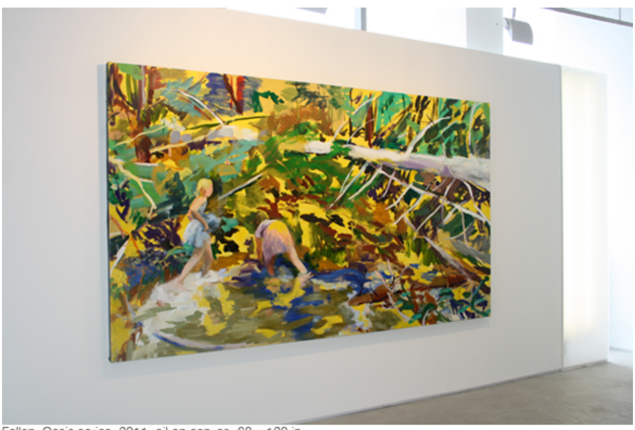
Fallen, Oasis series, 2011, oil on canvas, 68 x 120 in.

In Fallen, we see the early stages of Scott's exploration of abstract landscapes, which reflect a pervasive nostalgia for a disappearing and mysterious natural world. Scott's landscapes bring us back to the nature of our childhood, full of innocence and wonder alongside shadows and lurking danger. The felled branches that appear in many of the landscapes epitomize this, both a symbol of destruction, and a way forward, a path across a river. The figures in the painting provide a link between Scott's earlier work which is defined by explorations of the human figure and the increasingly abstract terraskin landscapes. Scott's voice as an artist is defined both by the tenets of abstraction, and an enduring love for the craft and compositional acumen of the old masters, which is perfectly conveyed in the gestural but evocative rendering of the children.