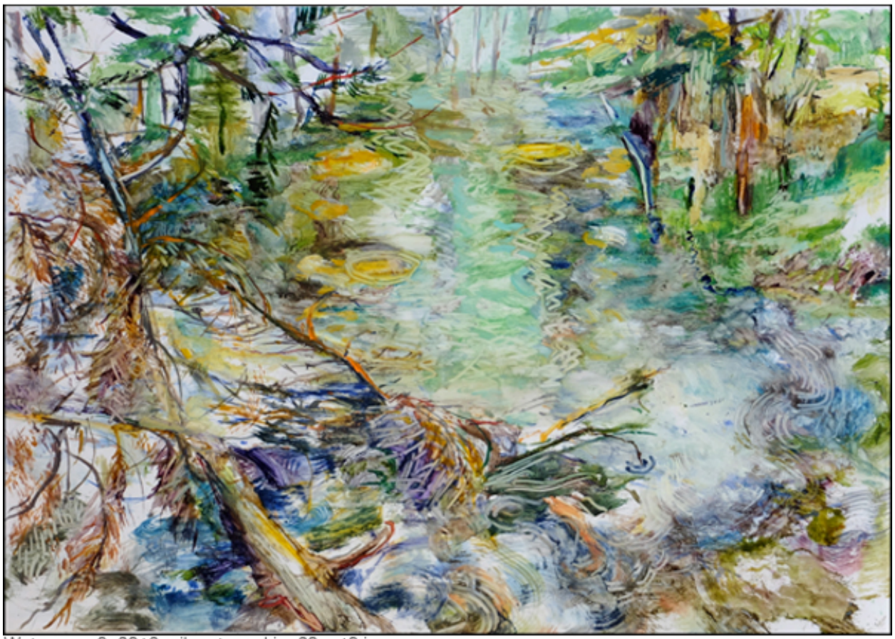
Waters no. 6, 2013, oil on terraskin, 28 x 40 in.

Influenced by Chinese and Japanese landscape painting, Scott's paintings abandon traditional perspective, rather choosing to situate the viewer directly within the landscape. The exclusion of the horizon line changes the engagement of the viewer to the work; as Scott explains, "instead of situating oneself in the unknown or in a very certain perspectival space, one is situating the body in a much more direct presence." The remarkable nearness of Scott's paintings creates a sense of being 'in' and traveling through the landscape, establishing a rare immediacy of feeling. Scott's lyrical meditation on the natural world is dynamic and alive, placing her among Canada's best landscape painters.